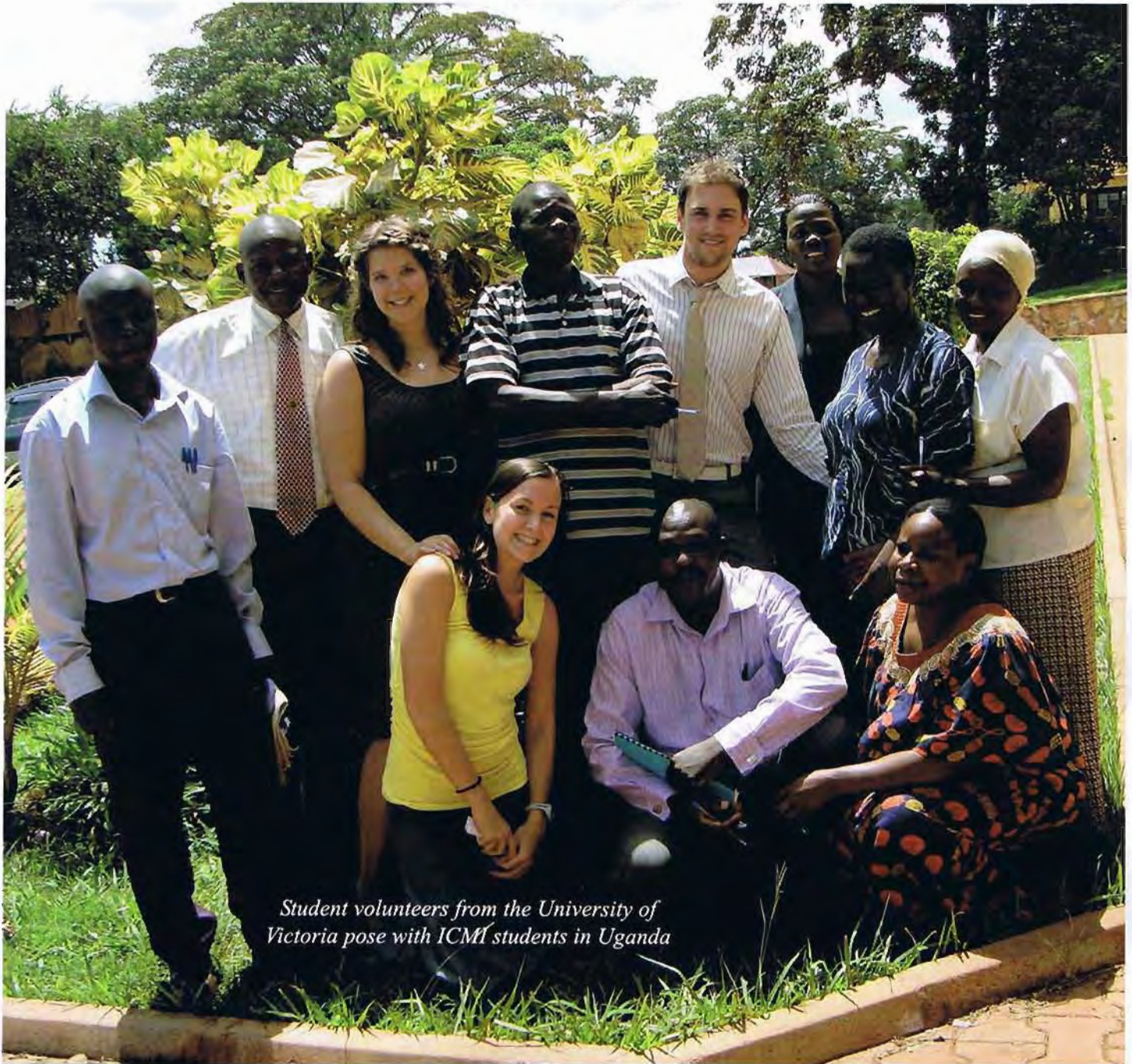
Student volunteers from the University of Victoria pose with ICMI students in Uganda

A PUBLICATION OF THE INTERNATIONAL CHRISTIAN MEDICAL INSTITUTE (CANADA) NUMBER TWENTY-ONE, FALL 2009