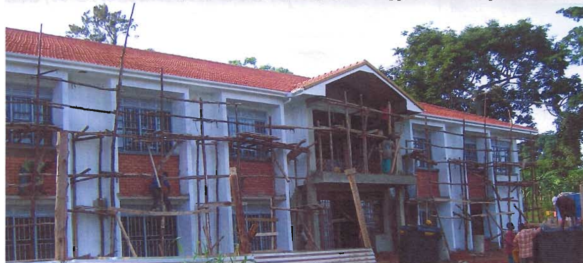
"They have put the first coating of paint and it is shining!"

Thank you for all your prayers and your generous financial support which helped make the dream come true.