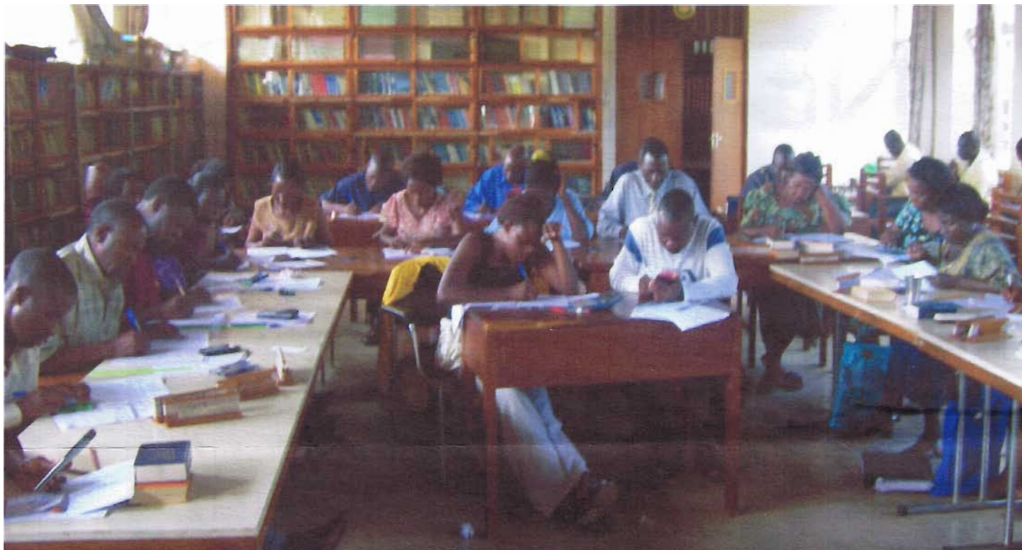
Students at work in the ICMI classroom at Uganda Protestant Medical Bureau