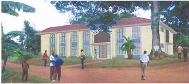
ICMI's building project at Uganda Christian University is now underway.