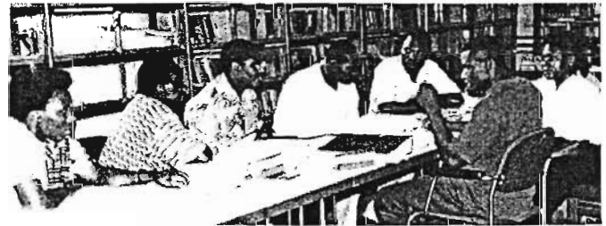
Students in our Health Administration course

ICMI's Health Administration programme continues to be an important part of ICMI's work in Uganda. The students shown in the picture have just completed their second semester. All the books used by the students, including the library books shown in the background, are the result of your generous donations. There are now 4,000+ volumes in the library which is fully catalogued. Paper, pens, workbooks are all provided for the students.