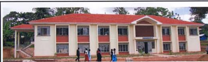
The ICMI building at Uganda Christian University

This gift is eligible for a tax-deductible receipt.